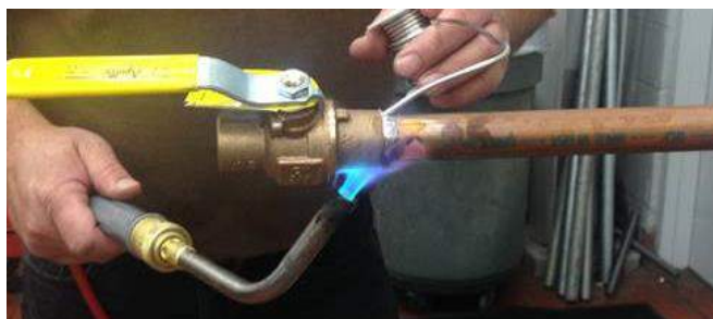
Figure 2 – Heat valve cup area and apply solder