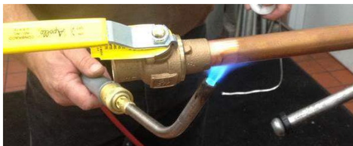
Figure 1 - Preheat tubing

Refer to ASTM B828 "Standard Practice for Making Capillary Joints by Soldering of Copper Tube and Fittings" . Preheat for soldering by concentrating the heat on the tube first, then the valve solder cup, always directing the heat away from body joint. See figure 1. The extent of this preheating depends on the size of tube. After preheating direct the heat on the valve cup area (avoiding the body joint) to aid capillary action in drawing the molten filler metal into the cup. See figure 2.