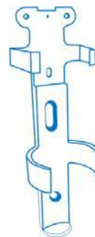
EZ Snap Bracket