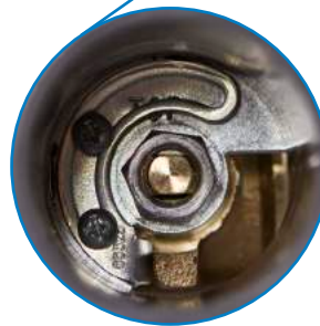
Memory stop enables system balancing