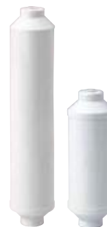
WICA WICSA WIC-6A