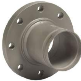
No. 445F and No. 445R Flange Adapter Nipple 1 ¼ – 12"/DN32 – DN300