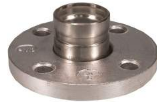
No. 441N Van Stone Flange Adapter 2 – 12"/DN50 – DN300