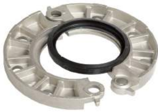
Style 441 Vic-Flange 2 – 6"/DN50 – DN150