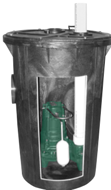
912-0063 Deluxe Basin (Top Discharge)