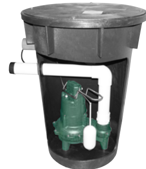
912-0082 (Side Discharge)