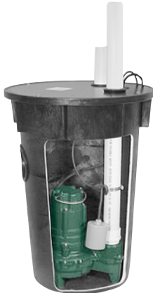
912-0017 (Top Discharge)