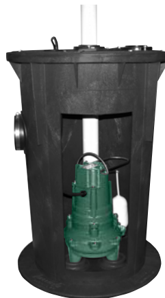
912-0088 Premium Basin (Top Discharge)