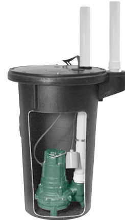
912-0056 (Top Discharge)