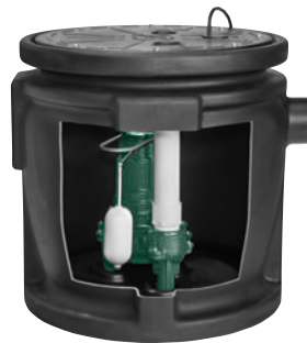
912-0116 Poly Molded Basin (Top Discharge)