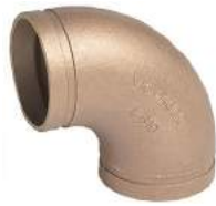
Copper Publication 22.04