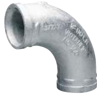
Galvanized Publication 07.01 for Original Groove Fittings Publication 20.05 for AGS Fittings