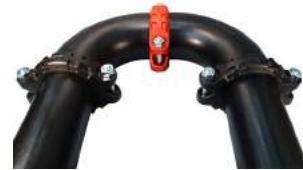
XL fittings for abrasive services Publication 07.07