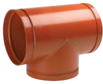
AGS - Advanced Groove System from 14 – 60"/DN350 – DN1500 Publication 20.05