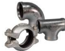
Shouldered Ends Publication 07.06