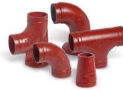
Ductile Iron for AWWA size pipe Publication 23.05