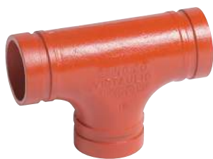
No. 20 Tee