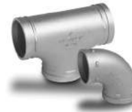
Aluminum Publication 21.03