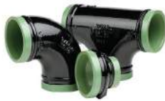
Extra Heavy EndSeal "ES" Publication 07.03