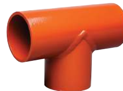
Plain End Publication 14.04