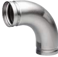
Stainless Steel Publication 17.16