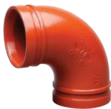
No. 10 Elbow