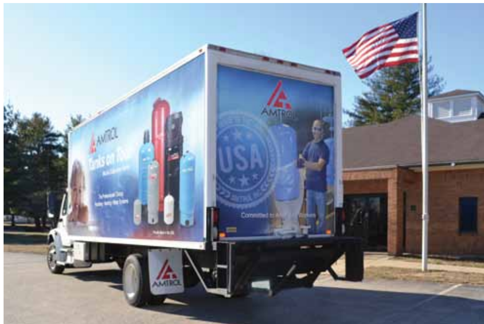
Tanks on Tour™ in front of the Amtrol Education Center.

All models are Amtrol Rewards™ eligible. Visit amtrolrewards.com