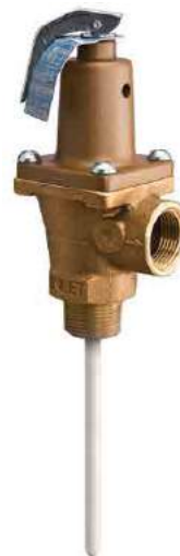
Series LF40L and LF40XL

*The wetted surface of this product contacted by consumable water contains less than 0.25% of lead by weight.