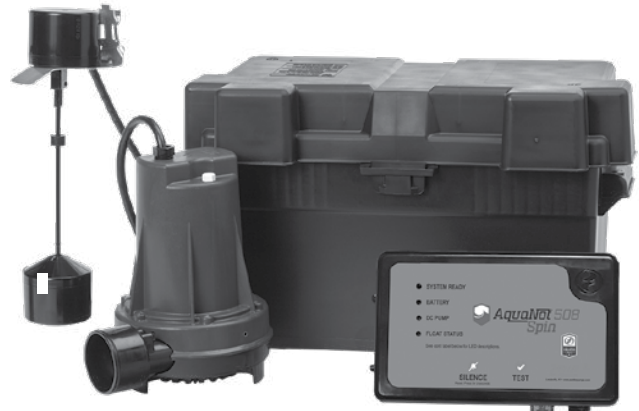
Aquanot® Spin 508 system

* If optional high water reed sensor is being used