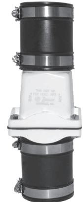
30-0021 Pvc Plastic

Consult Factory or local representative for state approvals