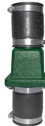
30-0151 Cast Iron