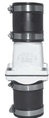
30-0021 Pvc Plastic

Consult Factory or local representative for state approvals