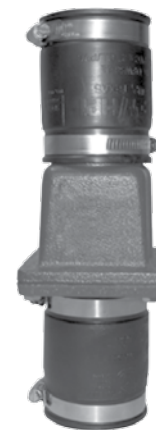
30-0151 Cast Iron