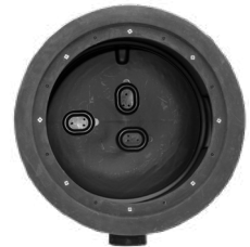
Built-in Torque Stops