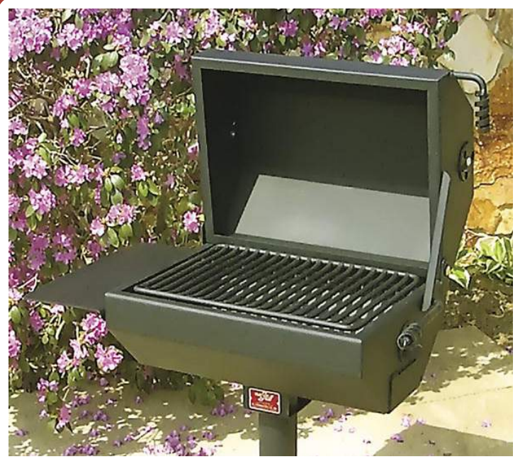
Model EC-26/S B2 Grill with Standard Side Utility Shelf